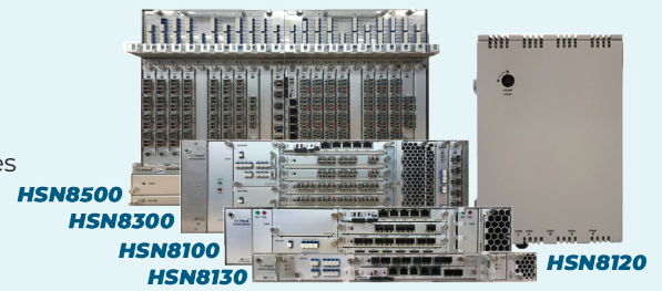
flexiHaul HSN8000 Series